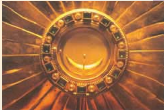
Exaltation: The Roman Catholic monstrances use a crescent to mount the wafer-god, thus duplicating the pagan imagery of the solar disc in a crescent, the ancient symbol of cosmic conception.

In the movements now in progress in the United States to secure for the institutions and usages of the church the support of the State, Protestants are following in the steps of papists. Nay, more, they are opening the door for popery to regain in Protestant