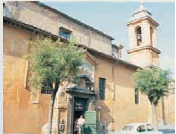
Pagan Temple: St. Clements Basilica built over the pagan temple of Mithras.

The royal mandate not proving a sufficient substitute for divine authority,