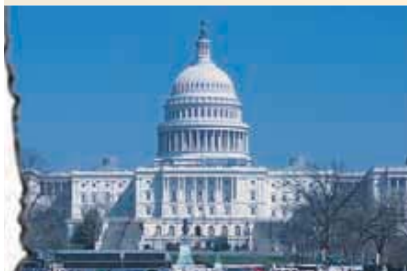
Building (right), United States of America freedom demands separation of church and State.

But Romanism as a system is no more in harmony with the gospel of Christ now than at any former period in her history. The Protestant churches are in great darkness, or they would discern the signs of the times. The Roman Church is far-reaching in her plans and modes of operation.