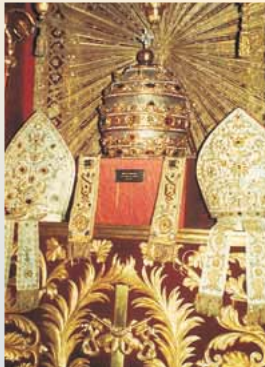
Splendour: The abundance of riches, gold and jewels associated with the rituals of worship.

Many Protestants suppose that the Catholic religion is unattractive, and that its worship is a dull, meaningless round of ceremony. Here they mistake. While Romanism is based upon deception, it is not a coarse and clumsy imposture. The religious service of the Romish Church is a most impressive ceremonial. Its gorgeous display and solemn rites fascinate the senses of the people, and silence the voice of reason and of conscience. The eye is