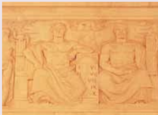
Codifying Freedom: Supreme Court in U.S.A. showing the Ten Commandments with bended knee covering first table of the Law

The defenders of popery declare that the church has been maligned; and the Protestant world are