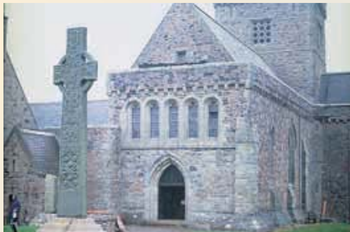
Iona Abbey: Built on the site of the old monastic school established by the missionary Columba in 536 A.D.. The mission school sent missionaries throughout Scotland, England, Wales and Europe. Columba and his monks observed the Biblical seventh day as the Sabbath.

Later, the pope gave directions that the parish priest should admonish the violators of Sunday, and wish them to go to church and say their prayers, lest they bring some great calamity on themselves and neighbors. An ecclesiastical council brought forward the argument, since so widely employed, even by Protestants, that because persons had been struck by lightning while laboring on Sunday, it must be the Sabbath. "It is apparent," said the prelates, "how high the displeasure of