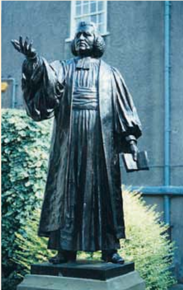
John Wesley: Well renowned English reformer appeals to the people to make the Bible their only Creed.

Marvelous in her shrewdness and cunning is the Romish Church. She can read what is to be. She bides her time, seeing that the Protestant churches are paying her homage in their acceptance of the false Sabbath, and that they are preparing to enforce it by the very means which she herself employed in by-gone days. Those who reject the light of truth will yet seek the aid of this self-styled infallible power to exalt an institution that originated with her. How readily she will come to