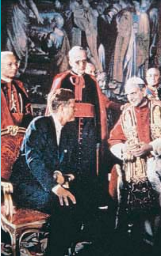
Concessions: America's President meeting for dialogue with the Pope and his cardinals.

She is employing every device to extend her influence and increase her power in preparation for a fierce and determined conflict to regain control of the world, to re-establish persecution, and to undo all that Protestantism has done. Catholicism is