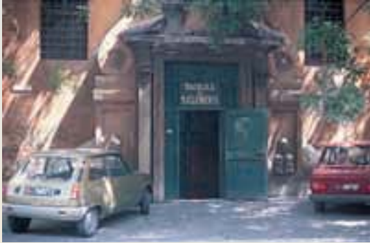
Historical sites: Entrance to St. Clements Basilica

Eusebius, a bishop who sought the favor of princes, and who was the special friend and flatterer of Constantine, advanced the claim that Christ had transferred the Sabbath to Sunday. Not a single testimony of the Scriptures was produced in proof of the new doctrine. Eusebius himself unwittingly acknowledges its falsity, and points to the real authors of the change. "All things," he says, "whatsoever that it was duty to do on the Sabbath, these we have transferred to the Lord's day." But the Sunday argument, groundless as it was, served to embolden men in trampling upon the Sabbath of the Lord. All who desired to be honored by the world accepted the popular festival.