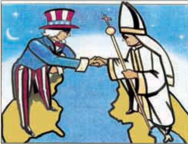
Reconciliation: Reintroduction of unity between church and State.

may be led into the truth. Although priding themselves on their enlightenment, they are ignorant both of the Scriptures and of the power of God. They must have some means of quieting their consciences; and they seek that which is least spiritual and humiliating. What they