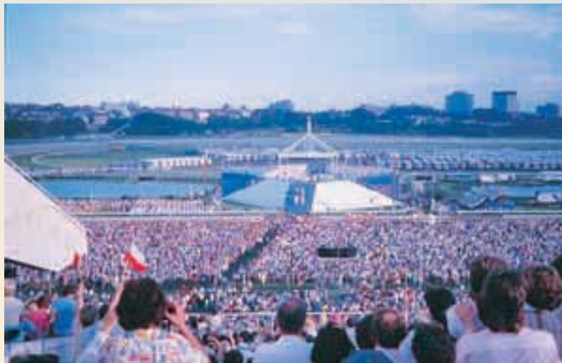
Worship: People from all walks of life attending mass at Sydney, Australia.

It is true that there are real Christians in the Roman Catholic communion. Thousands in that church are serving God according to the best light they have. They are not allowed access to his Word, and therefore they do not discern the