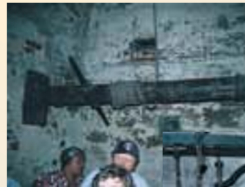
Torture: Implements of torture used on the Albigenses and Huguenots.

It is Satan's constant effort to misrepresent the character of God, the nature of sin, and the real issues at stake in the great controversy. His sophistry lessens the obligation of the divine law, and gives men license to sin. At the same time he causes them to cherish false conceptions of God, so that they regard him with fear and hate, rather than with love. The cruelty inherent in his own character is attributed to the Creator; it is embodied in systems of religion, and expressed in modes of worship. Thus the minds of men are blinded, and Satan secures them as his agents to war against God. By perverted conceptions of the divine attributes, heathen nations were led to believe human sacrifices necessary to secure the favor of Deity; and horrible cruelties have been perpetrated under the various forms of idolatry. The Romish Church, uniting the forms of paganism and Christianity, and, like paganism, misrepresenting the character of God, has resorted to practices no less cruel and revolting. In the days of Rome's supremacy, there were instruments of torture to compel assent to her doctrines. There was the stake for those who would not concede to her claims. There were massacres on a scale that will never be known until revealed in the Judgment. Dignitaries of the church studied, under Satan their master, to invent means to cause the greatest possible torture, and not end the life of