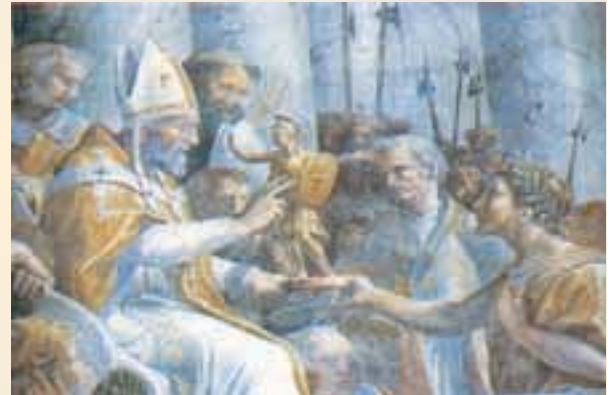
Penance: Painting of the "Donation of Constantine," Vatican Museum.

Christian world. The first public measure enforcing Sunday observance was the law enacted by Constantine. A. D. 321. This edict required townspeople to rest on "the venerable day of the sun," but permitted countrymen to continue their agricultural