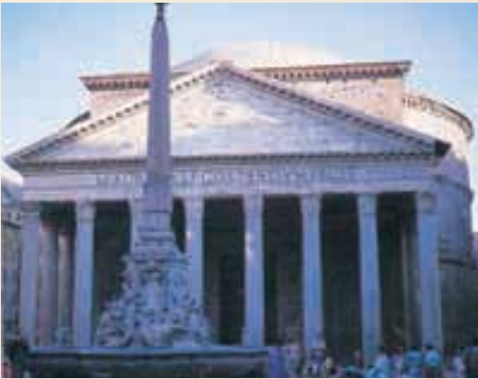
Paganism: Rome's famous pagan temple "The Pantheon".

Papists place crosses upon their churches, upon their altars, and upon their garments. Everywhere is seen the insignia of the cross. Everywhere it is outwardly honored and exalted. But the teachings of Christ are buried beneath a mass of senseless traditions, false interpretations, and rigorous exactions. The Saviour's words concerning the bigoted Jews, apply with still greater force to the Romish leaders: "They bind heavy burdens and grievous to be borne, and lay them on men's shoulders; but they themselves will not move them with one of their fingers." MATT. 23:4. Conscientious souls are kept in constant