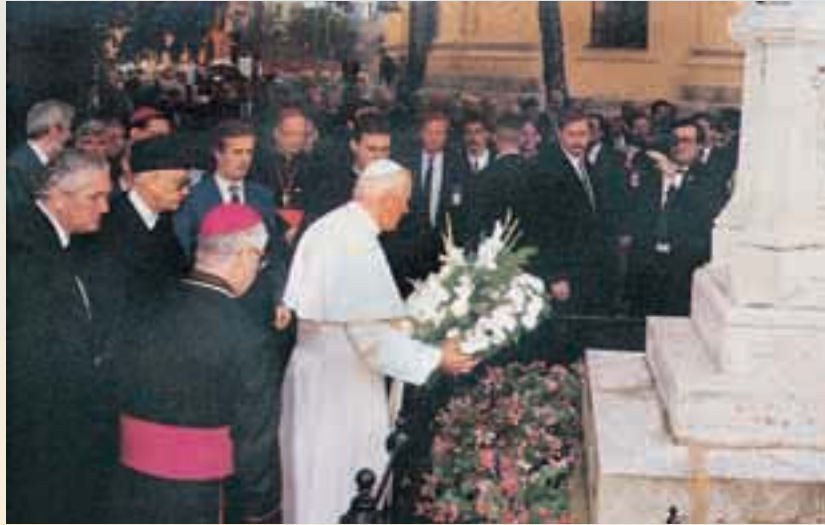
Apologies: Pope lays a wreath in Hungary, and apologises for past mistakes.

day. The doctrines devised in the darkest ages are still held. Let none deceive themselves. The popery that Protestants are now so ready to honor is the same that ruled the world in the days of the Reformation, when men of God stood up, at the peril of their lives, to expose her