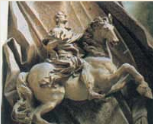
Sunday Exaltation: Statue of "The Vision of Constantine" (AD 312) in St. Peter's Basilica.

America the supremacy which she has lost in the Old World. And that which gives greater significance to this movement is the fact that the principal object contemplated is the enforcement of Sunday observance,—a custom which originated with Rome, and which she claims as the sign of her authority. It is the spirit of the papacy,—the spirit of conformity to worldly customs, the veneration for human traditions above the commandments of God,—that is permeating the Protestant churches, and leading them on to do the same work of Sunday exaltation which the papacy has done before them.