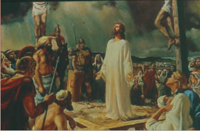
The cross; where the Son of God paid the ultimate sacrifice for mans disobedience.

In seeking to cast contempt upon the divine statutes, Satan has perverted the doctrines of the Bible, and errors have thus become incorporated into the faith of thousands who profess to believe the Scriptures. The last great conflict between truth and error is but the final struggle of the long-standing controversy concerning the law of God. Upon this